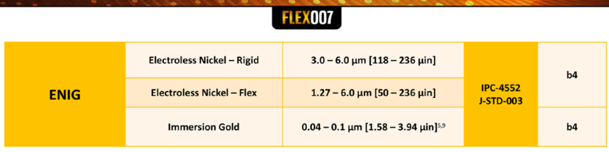
Table 2: IPC-6013 ENIG requirements.

laminating FR-4 stiffeners to the flex, the highpressure lamination process can put undue stress on the plated through-hole barrel, subsequently making the circuit less reliable.